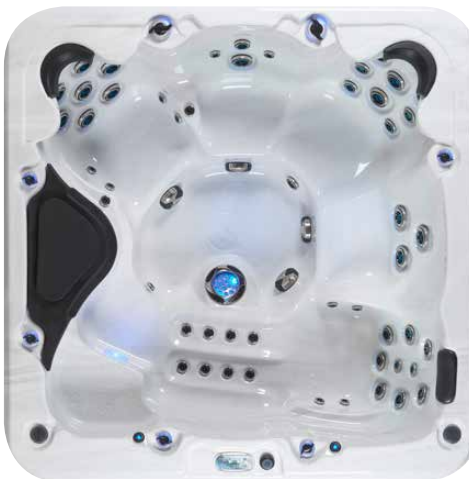
Premium Madrid 60 91 x 91 x 36" Lounge. Seats up to 6.