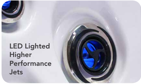
LED Lighted Higher Performance Jets