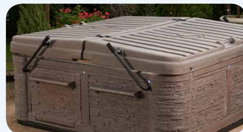
DURA-SHIELD HardCover with UltraStrong CoverLift