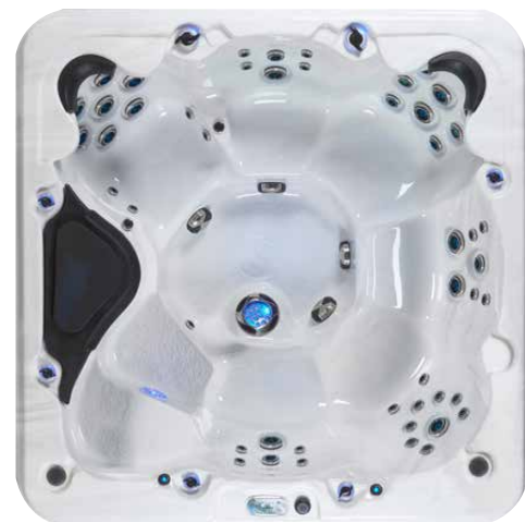
Premium Vienna 60 91 x 91 x 36" Non-Lounge. Seats up to 7.